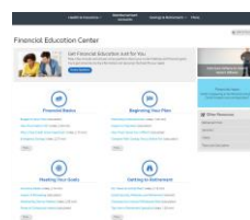
Financial Education Center