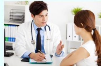
Steady Performer Package