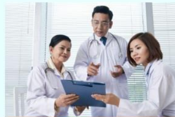
Diamond Jubilee Package