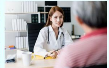
Golden Jubilee Package