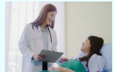
Family Plus Package